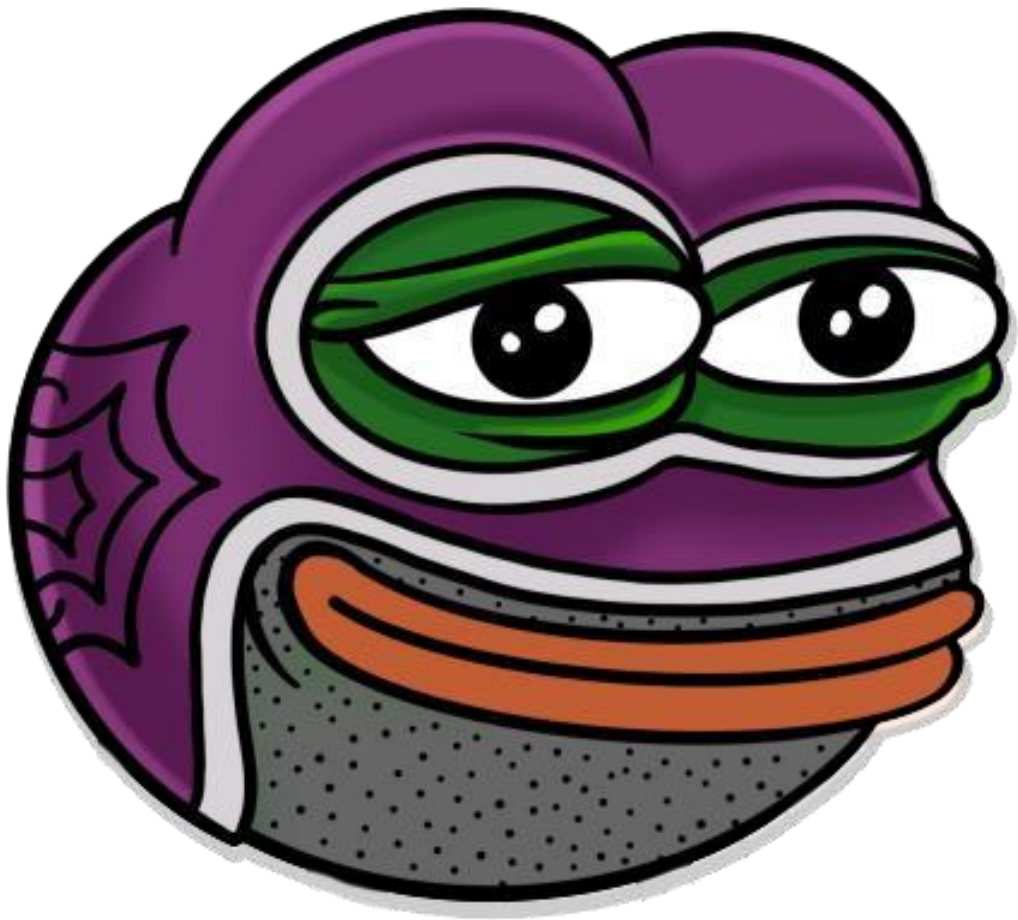
WHITEPAPER PEPE the Wrestler